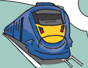
Folkestone Central Station